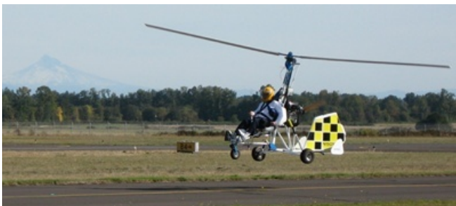
Above: Kevin Richey lands at Scappoose.

The next meeting will be June 12, 2010 at 1:00 PM in Scappoose, OR at the Sport Copter Hangar. The meeting was adjourned at approximately 2:26 PM.