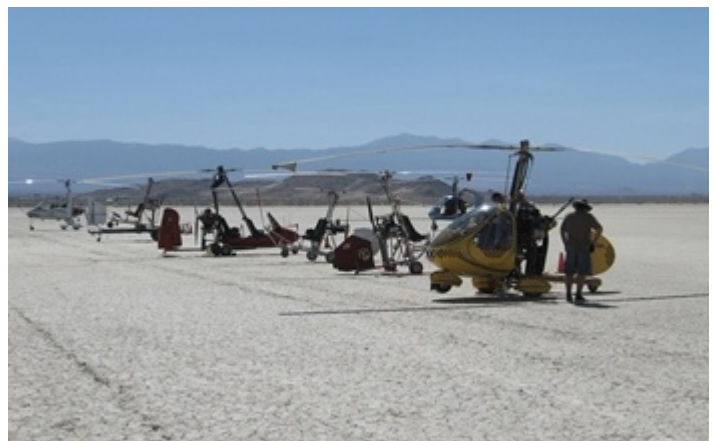
Above, the flightline at KBFFI 2010, El Mirage, CA.

sunglasses, protective clothing, a good hat, and plenty of water. The sun is very intense due to the 2,840' MSL elevation and reflections off the light colored lakebed. Find more event details at www.kbffi.com .